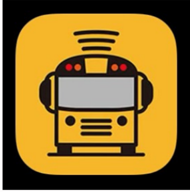
Here Comes the Bus